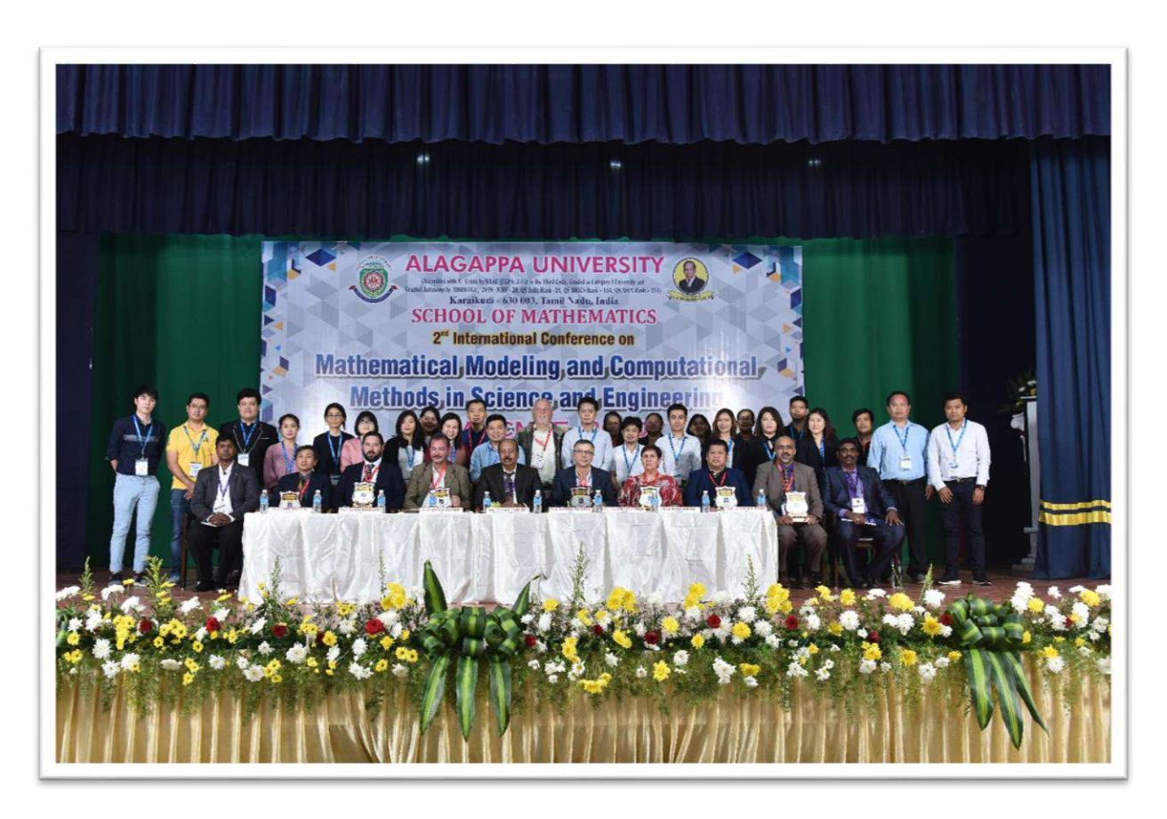
Participants from 9 various countries (Thailand, Turkey, Romania, Philippines, Indonesia, Saudi Arabia, Australia, United Kingdom, Nigeria) for 2<sup>nd</sup> ICMMCMSE-2020